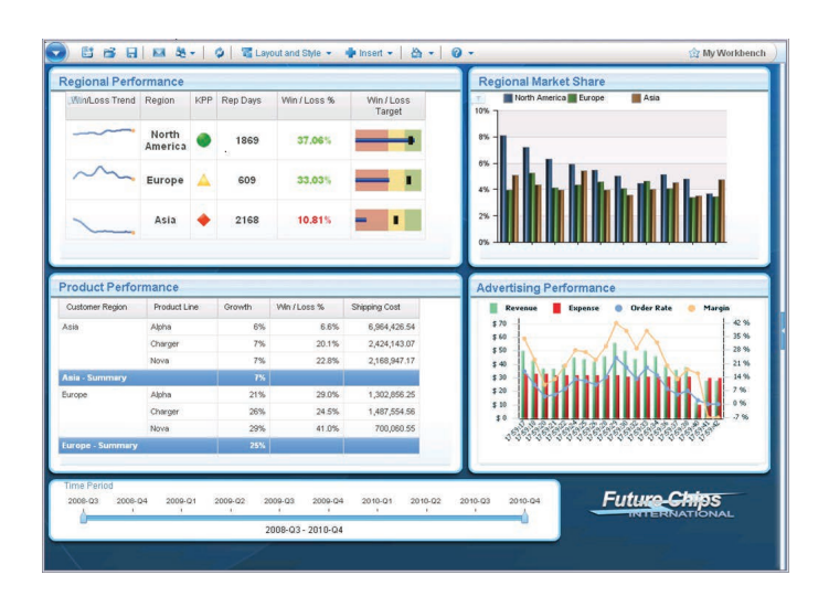
Figure 4: With Cognos Enterprise, users interact, share information and conduct comprehensive analytics in a unified workspace.

information, analyze key facts, quickly collaborate to gain alignment with key stakeholders and act with confidence to drive better business outcomes (Figure 4).