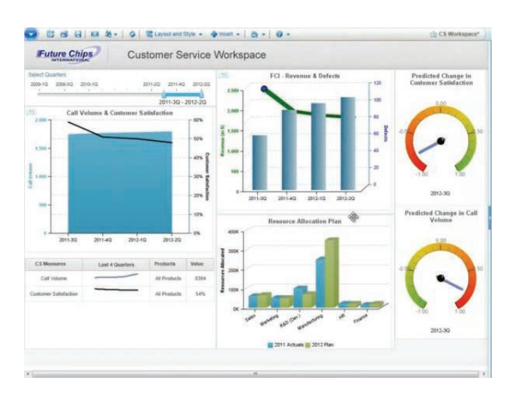
Figure 3: Analysis with Cognos Express.

require, at a price they can afford. Everything is included in a pre-configured solution that is designed to be easy to install and use. For organizations of any size that are beginning to embark or expand on a BI and planning strategy, Cognos Express includes what is needed to get started right away. It offers powerful business analytics capabilities for both novices and advanced users to encourage use throughout your company.