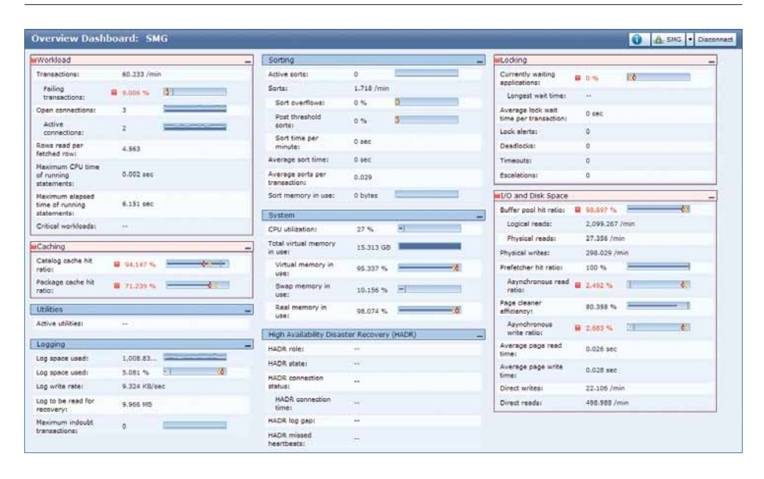
Figure 1: The InfoSphere Optim Performance Manager dashboard has a color-coded, web-based interface designed to quickly alert users to problematic areas. Once a problem has been identified, specific diagnostics and details are provided to focus on that area. Integration with InfoSphere Optim products provides the resolution needed to correct the problem.

Integrated tools within InfoSphere Optim Performance Manager are designed to enable easy setup and use of IBM DB2 Workload Manager, which helps ensure that system database resources are applied according to the priorities of the business. Historical performance data provides the necessary context for proactive performance management, trend analysis